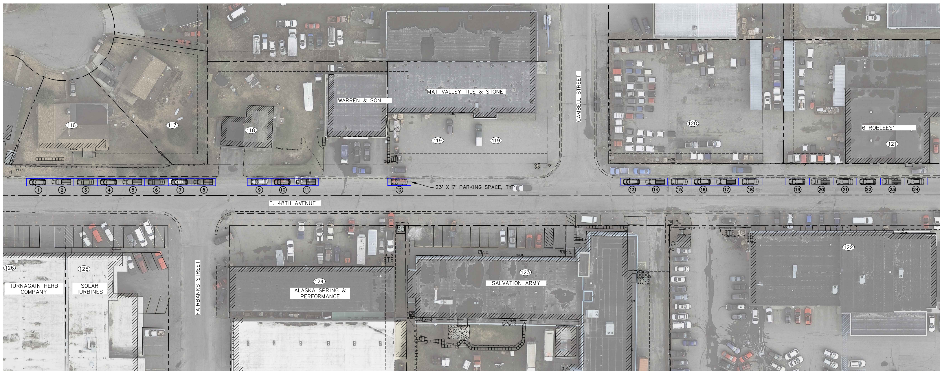
EXISTING ON-STREET PARKING